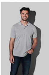
ST9060 C Harper Polo