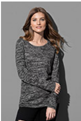
ST9180 Knit Long Sleeve