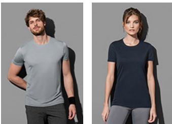
ST8000 Sports-T ST8100 Sports-T