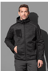
ST5860 Recycled Fleece Jacket Hero