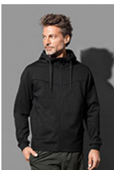
ST5840 Recycled Scuba Jacket