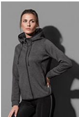
ST5940 Recycled Scuba Jacket