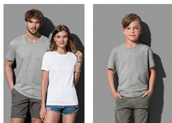
ST2020 Classic-T Organic Unisex ST2220 Classic-T Organic Kids