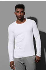
ST9620 Clive Long Sleeve