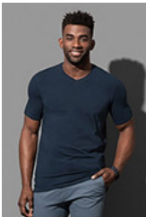
ST9610 Clive V-neck