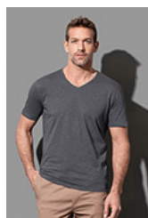
ST9410 Shawn Slub V-neck