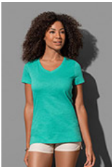
ST9510 Sharon Slub V-neck