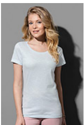
ST9500 Sharon Slub Crew Neck