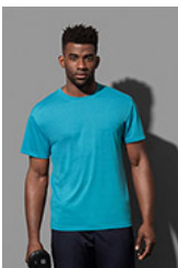
ST8600 Cotton Touch