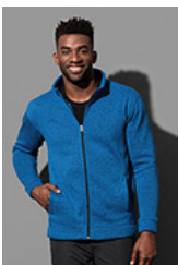
ST5850 Knit Fleece Jacket