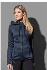
ST5950 Knit Fleece Jacket