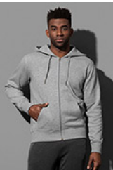
ST5610 Sweat Jacket Select