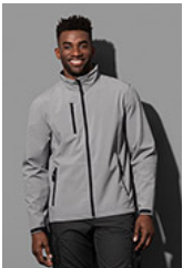
ST5230 Softest Shell Jacket