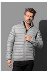
ST5200 Padded Jacket