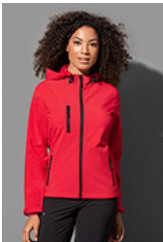
ST5340 Softest Shell Hooded Jacket