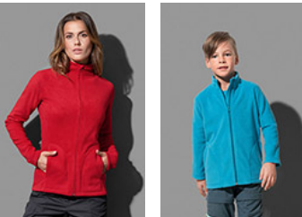
ST5100 Fleece Jacket ST5170 Fleece Jacket Kids