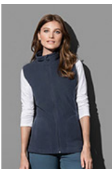
ST5110 Fleece Vest