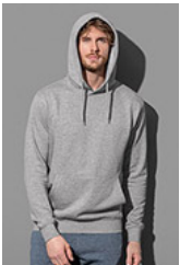
ST4100 Sweat Hoodie Classic